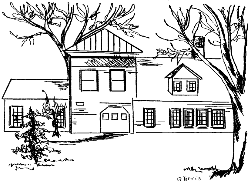
The Ingalls Studio

By 1921 there were six districts. In this year the State was divided into Supervisory Units with thirty six weeks of required schooling. In 1946 a site was purchased and the Central School was built. The first class entered in the fall of 1949. The last step was the formation in 1966 with Tilton and Northfield of the Winnisquam Regional School District. The use of busses made it possible for the seventh and eighth grades to go to Junior High School and made High School available to all. All high school students were gradually enrolled in the Tilton-Northfield High School.