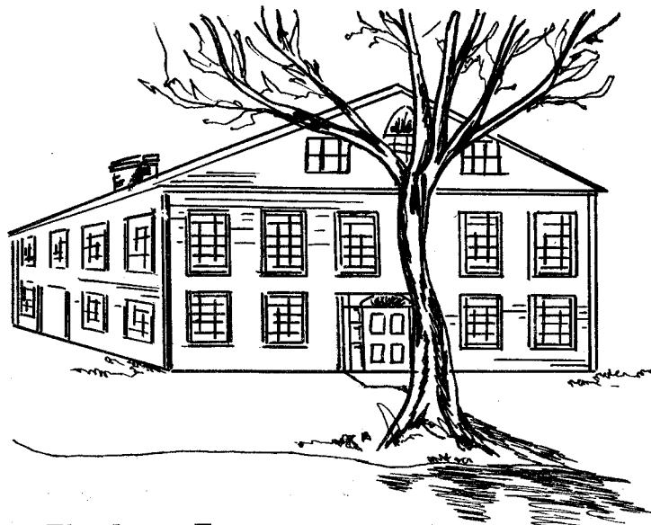
The Lane Tavern

Although there were several taverns in town, the Lane Tavern was one of the largest and was the last to close.