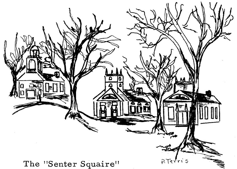
The "Senter Squaire"